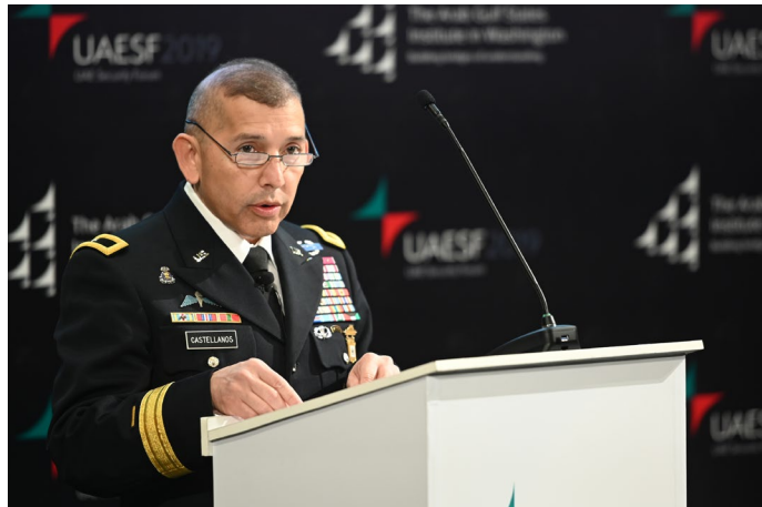
Brigadier General Miguel Castellanos, Deputy Director for Operations, U.S. Africa Command

More generally, speakers argued that foreign countries should consider the depth of the transformation that is sweeping across a region where youth make up a majority of the population. 8 The changes are driven by a better-educated, politically aware, and connected generation that is demanding government accountability and a healthy state-society relationship. Finding ways to support young entrepreneurs and providing quick access to credit could be solutions. There is also a need to rejuvenate the leadership on a continent where the median age is 19 and the average age of leaders is 62, according to Mutiga.