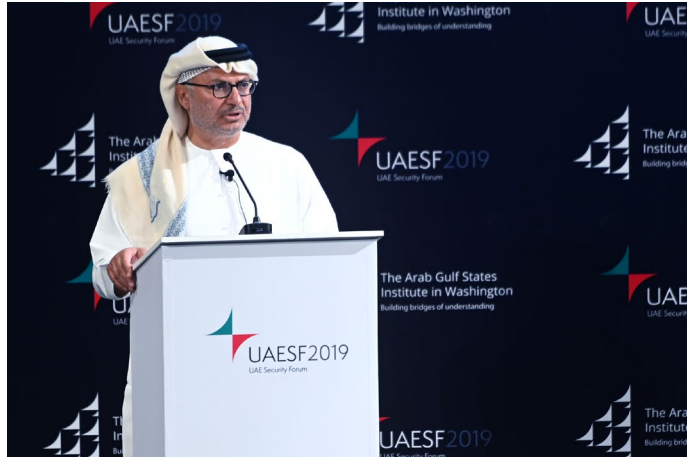
Anwar Gargash, Minister of State for Foreign Affairs, United Arab Emirates

Security concerns also figure highly on the agenda. The Red Sea is a strategic route for oil and natural gas shipments. In 2018, an estimated 6.2 million barrels of crude oil, condensate, and refined petroleum products flowed through the Bab el-Mandeb strait. 5 Uncertainty around the current international order and signs of a U.S. retrenchment from the region have pushed the Gulf countries to play a more proactive role in maritime security in this strategic waterway. In 2015, the UAE laid the groundwork for a military outpost in Assab, Eritrea. Qatar has also pursued ports and naval outposts in Sudan and Somalia, sometimes working in concert with Turkey, whose footprint in the region is expanding. Building on historic ties dating back to the Ottoman Empire, Ankara has established a $50 million military base in Somalia, 6 while working closely on establishing a port on the island of Suakin in Sudan.