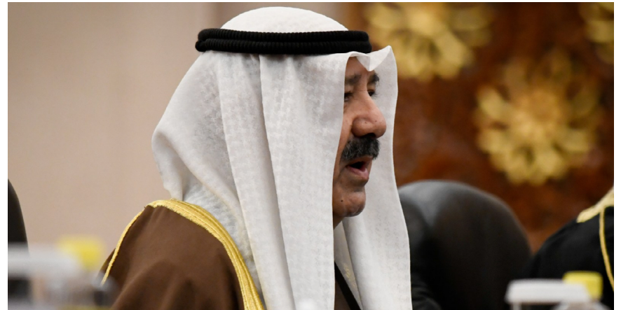
Kuwaiti Defense Minister and Deputy Prime Minister Nasser Sabah al-Ahmed al-Sabah speaks during a meeting in Beijing, China, December 17, 2018.