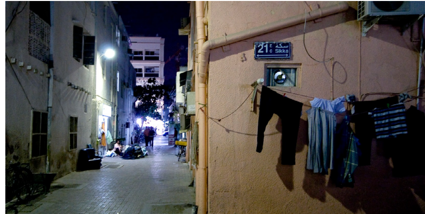
Alleyway in the Bur Dubai district of Dubai, highlighted in AGSIW's publication "Defying Transience: Urban Landscapes in the Gulf States"

Turki Al Sheikh, a larger-than-life figure in the crown prince's close inner circle, is leading a rise of nationalist music in the Saudi mainstream.