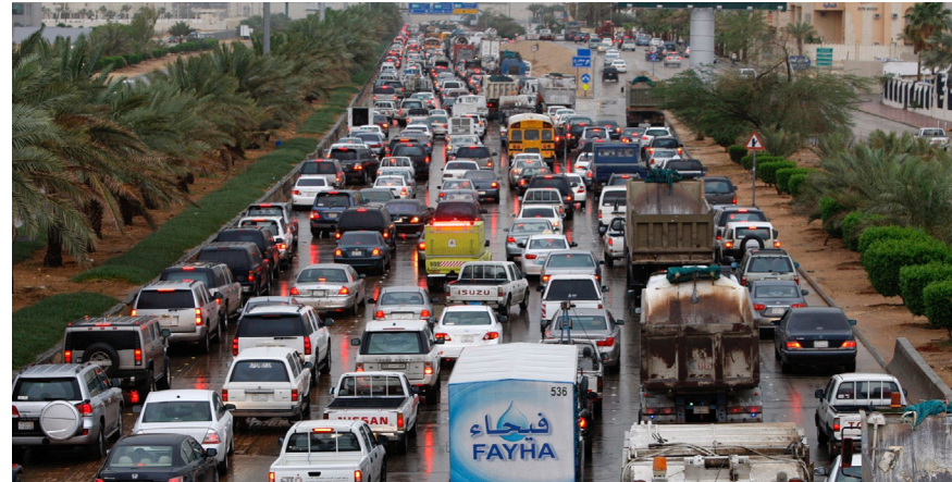
Vehicles are seen in a traffic jam, after a heavy rainstorm flooded roadways and streets, in Riyadh, Saudi Arabia, May 3, 2010.

Iraq aims to grow its oil and gas production capacity to meet its domestic needs, but this will take time, a commodity the country can ill afford.