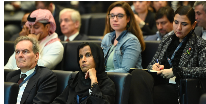
Members of the audience at the 2019 UAE Security Forum in Abu Dhabi