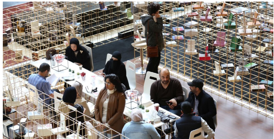
Readers gather for a charity reading marathon at Takween bookstore in 360 Mall, Kuwait, highlighted in AGSIW's Millennial Gulf blog.