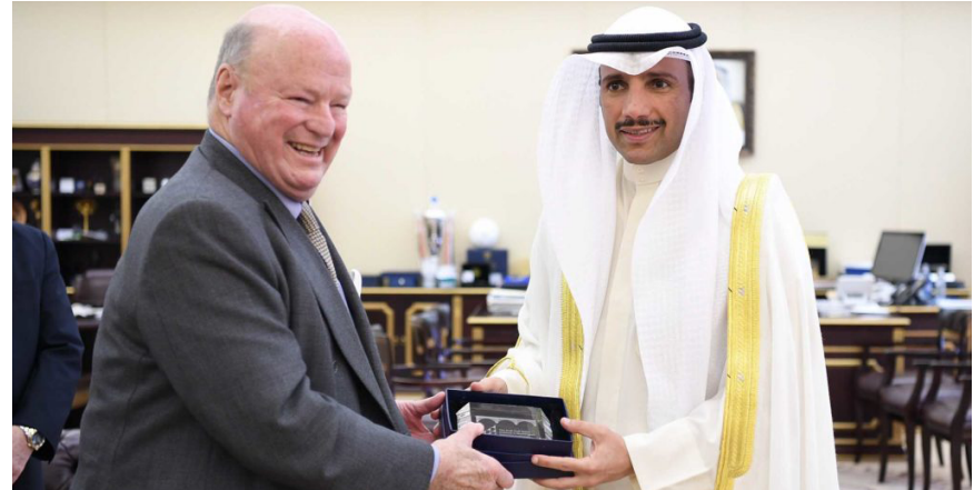
Ambassador Frank G. Wisner, AGSIW board chair, left, meets with Marzouq Al-Ghanim, speaker of Kuwait's national assembly.