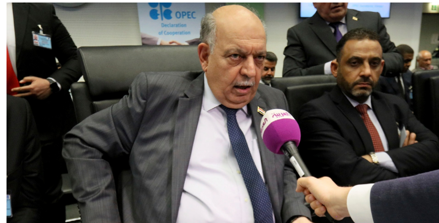
Iraqi Deputy Prime Minister for Energy Affairs and Oil Minister Thamir Ghadhban speaks prior to the start of an OPEC meeting in Vienna, Austria, July 1, 2019.