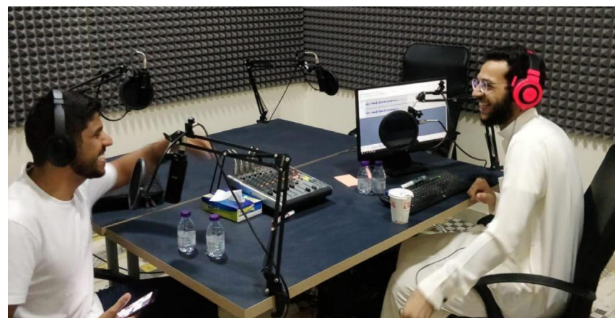
Students recording an episode for the podcast “al-Jabl,” hosted at Saudi Arabia’s King Fahd University of Petroleum and Minerals. AGSIW highlighted young podcasters in the region through the series “Podcast Production in the Gulf Arab States.”