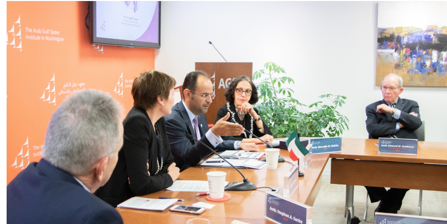
Nayef Al-Hajraf, minister of finance of Kuwait, center, discusses Kuwait Vision 2035 and its goal to transform Kuwait into an attractive financial and trade hub in the region.