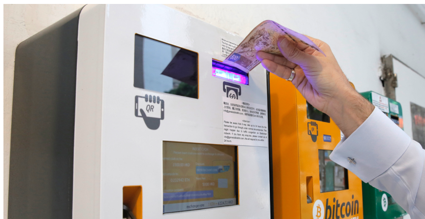
A man uses an Ethereum cryptocurrency ATM, May 11, 2018.